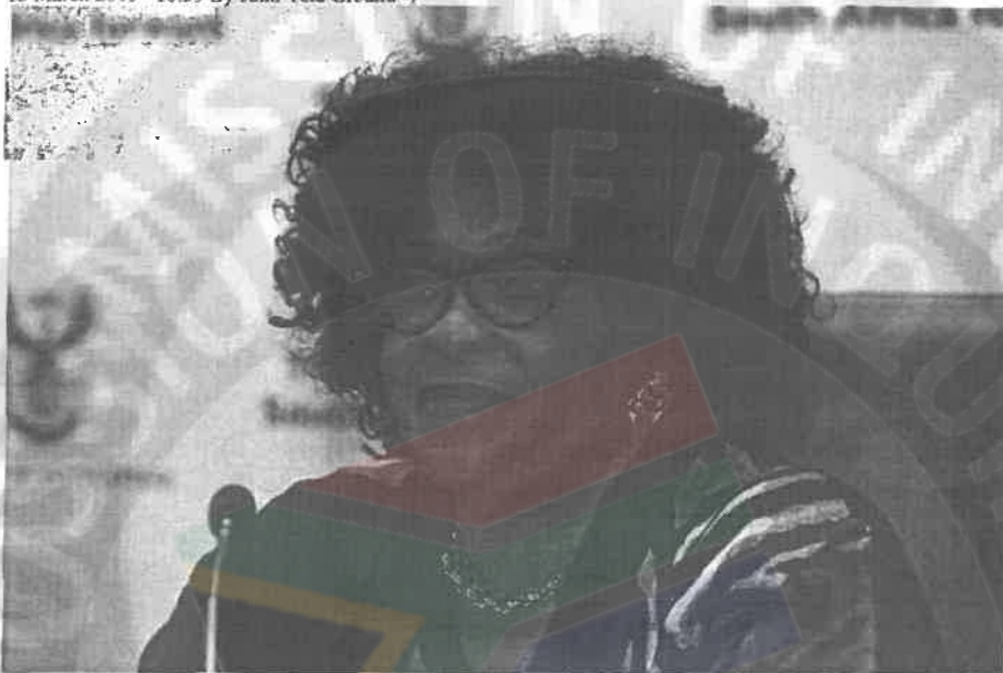
Minister of communications Nomvula Mokonyane.

13 March 2019 - 10:59 By John Yeld Ground up